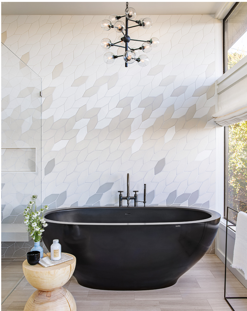
A luxurious soaking tub anchors the master bathroom.