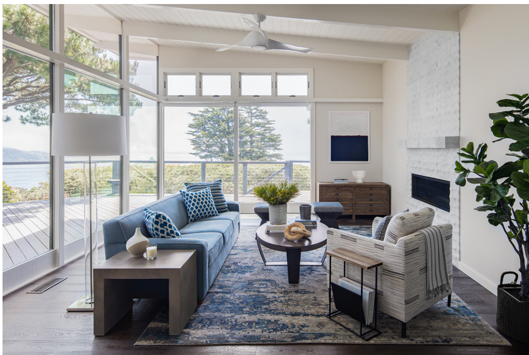
Stellar bay views were one of this home's many assets.