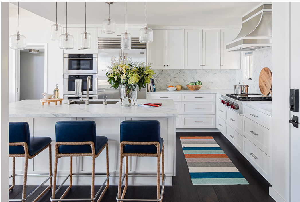
The home's new and improved kitchen.