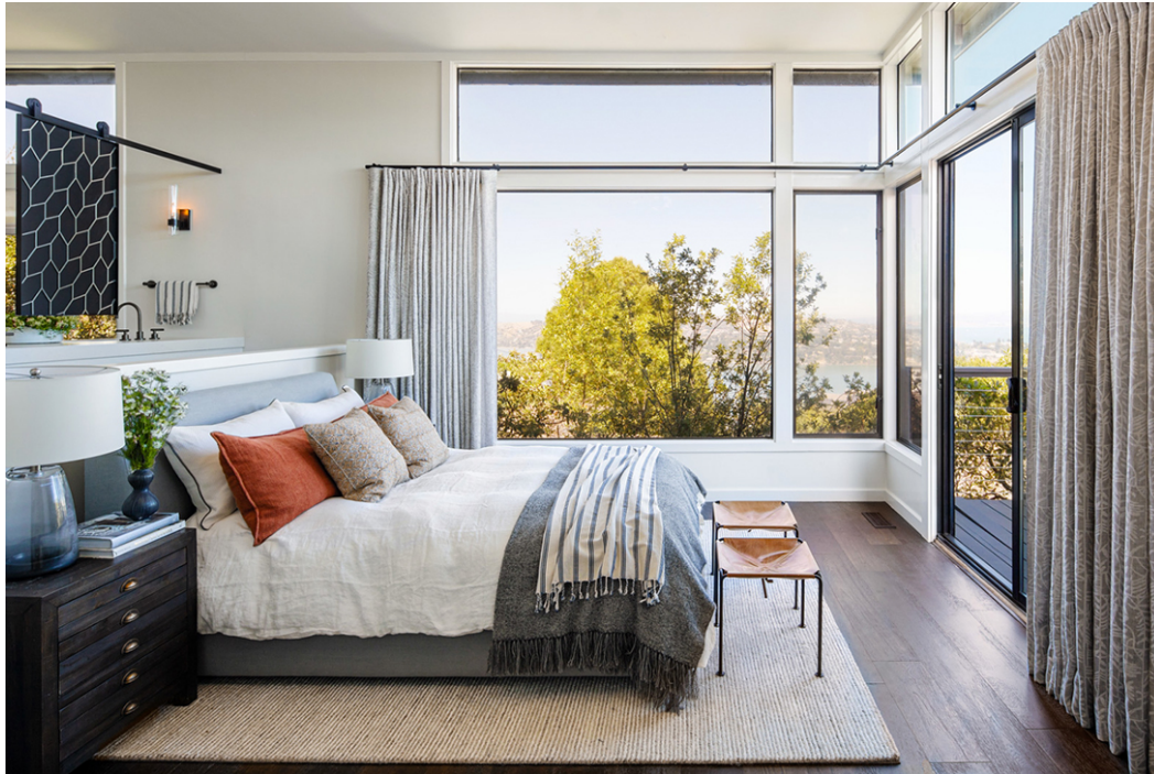
The master bedroom.