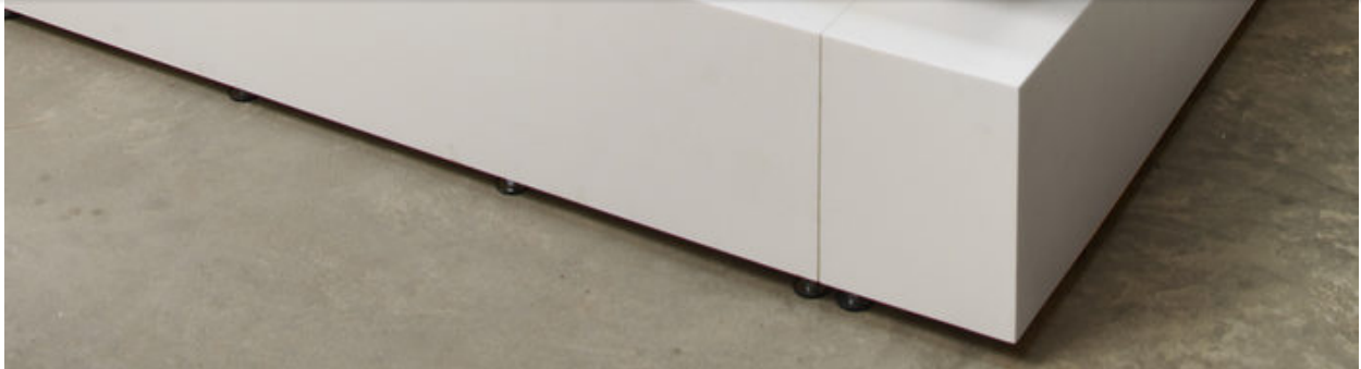
Aquatica Bath's Tessera Spa